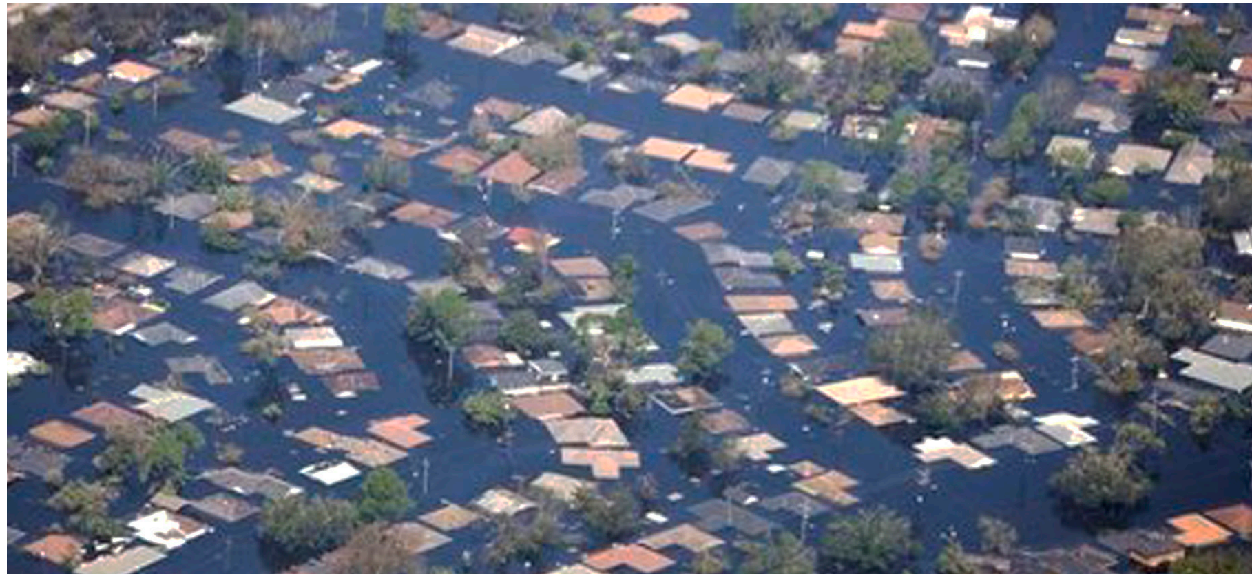
Flooding in New Orleans, 2005.

Unusual price increases are not likely to prevail beyond the first few days of the disaster aftermath. If they do, they perform the valuable function of signaling to the outside world the enormous gain to be made in breaking through the wreckage with additional—and inevitably more normally priced—supplies...suppressing