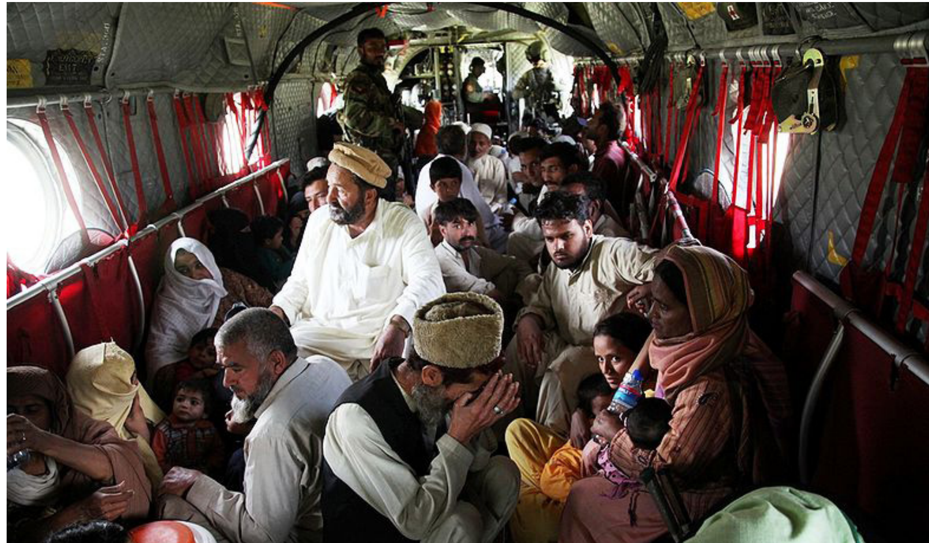
Pakistan's flood victims being relocated to safer ground.

For policy makers and survivors wishing to maximize growth and minimize recovery time,