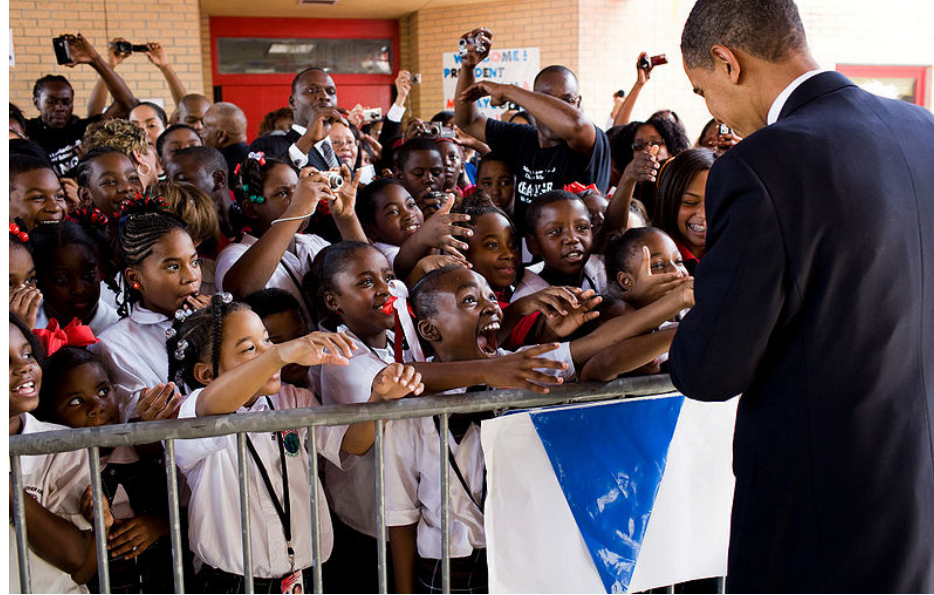
US President Obama visiting the Martin Luther King Jr. Charter School in New Orleans in 2009. Support for school choice increased dramatically in Louisiana after the Katrina disaster.

“In the case of Katrina, the shared response was shame . The word was blasted across the headlines of magazines and newspapers. It was...a confession of culpability and a rejec-