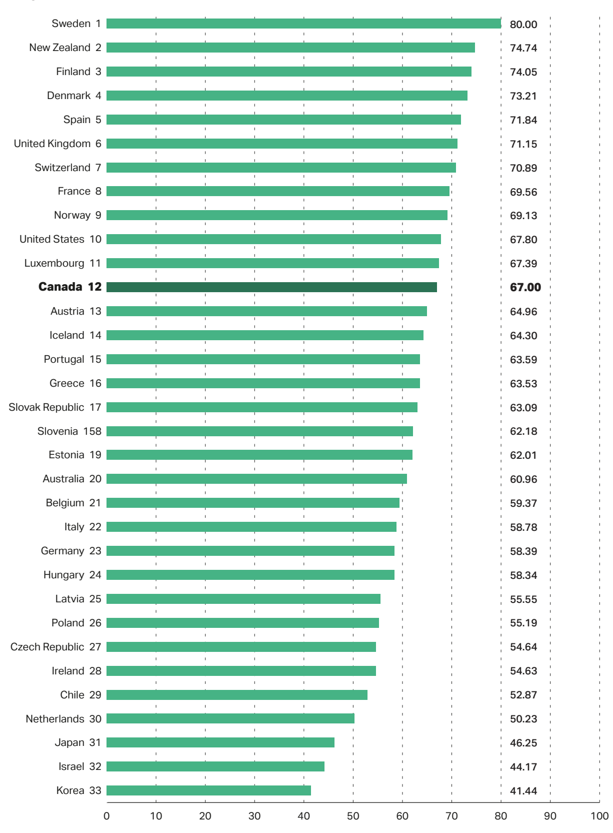
Figure 1: Index of Environmental Performance in Canada and the OECD, 2020